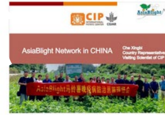
AsiaBlight Network in China

https://www.asiabligh.org/asia/4th-asiabligh-international-conference-nov-28-29-2024/